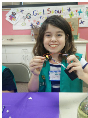
Pictured below: Girl Scouts showing off their projects

Last weekend, SWE Cypress Girl's volunteered at the OC SWE Girl Scout's Engineering Day event. During the event, volunteers helped Girl Scout's experience being engineers in different fields. They made lava lamps, water filters, mechanical arm, and more.