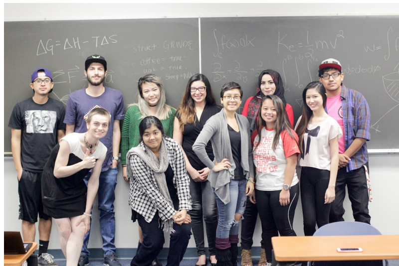
Welcoming new members every meeting

Everyone is welcome to join us tonight at the Tutor Auction tonight in SEM Room 112! Come out to volunteer, support and/or participate at the auction!